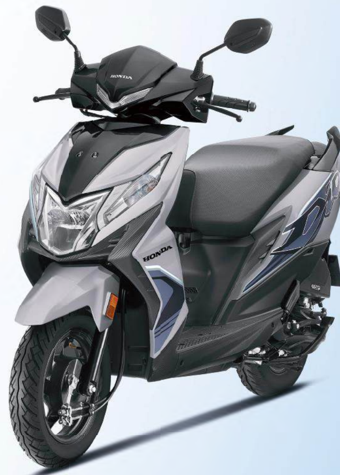
PEARL IGNEOUS BLACK + PEARL DEEP GROUND GRAY